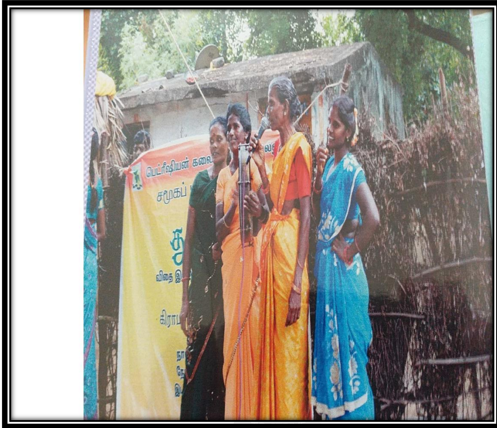
Participation of Irular Tribal Women through songs