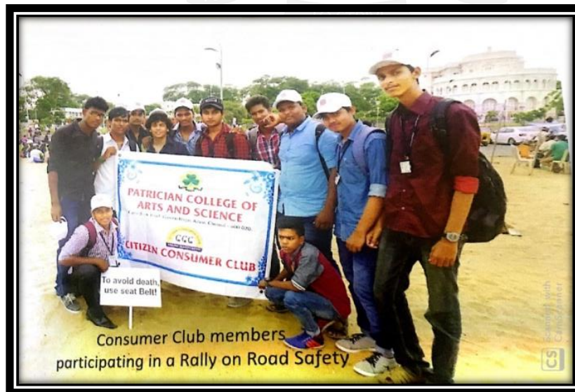
July 2016, Students participating in Rally on Road Safety