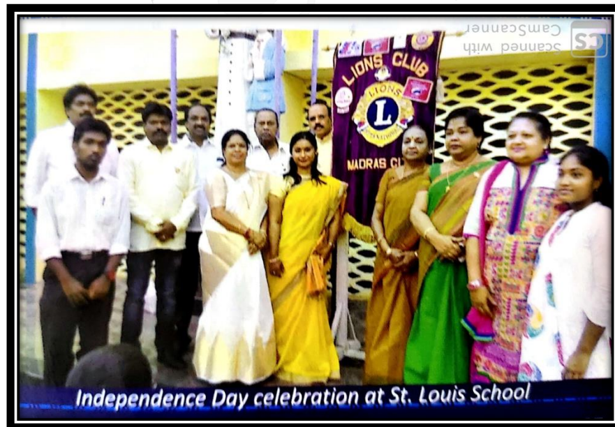
15/08/2017, the 69th Independence Day Celebrations at St. Louis Institute, Kotturpuram