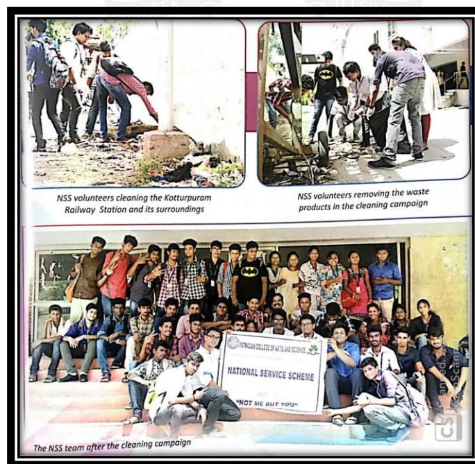
On 12th August 2016, NSS Student Volunteers Cleaning Campaign at Kotturpuram Railway Station